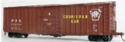
Pennsylvania "Original 1958 X58B" SKU 14020 (6#s)

TANGENT SCALE MODELS In-stock now for ordering!