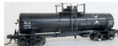
UCLX Vulcan Materials 1966+ SKU 22063 (2#s)