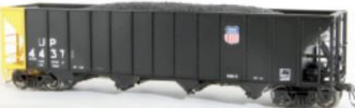
UP "1989 H-100-17 Black Repaint" SKU 10861 (3#s) New Numbers for 2019