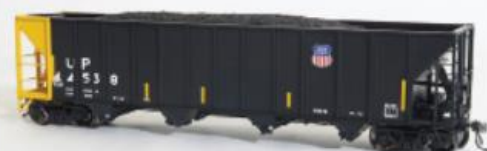
UP "H-100-18 Black Repaint Conspicuity 2005+" V2 - SKU 10871 (1#)