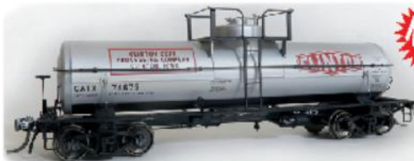
GATX Clinton Corn 1958+ SKU 22121 (4#s)

TANGENT SCALE MODELS In-stock now for ordering!