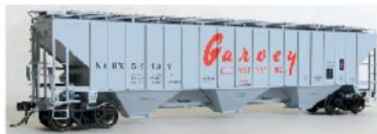
NAHX "Garvey Grain 12-1973" SKU 20041 (4#s)