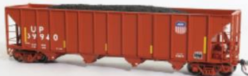
UP "H-100-16 Red Repaint Conspicuity 2005+" SKU 10869 (1#)