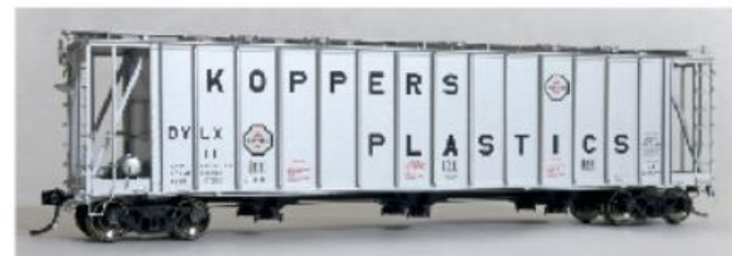
DY LX Koppers Plastics 1961+ SKU 12024 (2#s)