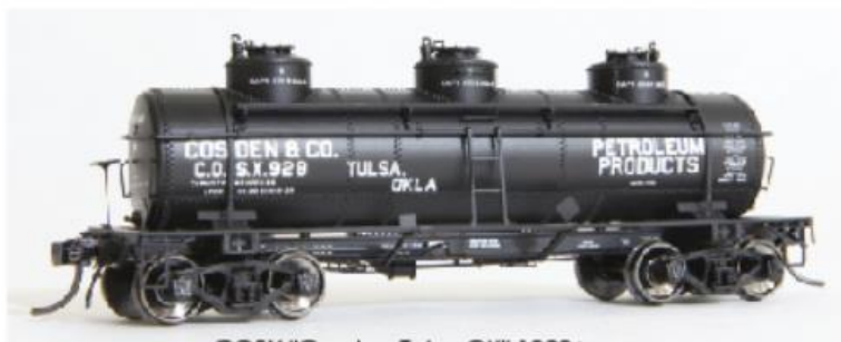
COSX "Cosden Tulsa OK" 1929+ SKU 11518 (2#s)

TANGENT SCALE MODELS In-stock now for ordering!