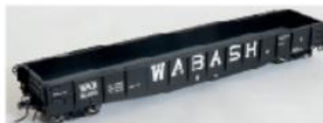
Wabash "Original 1957" SKU 10924 (4#s)