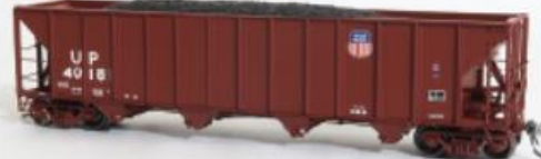
UP "1989 H-100-16 Red Repaint" SKU 10864 (1#)