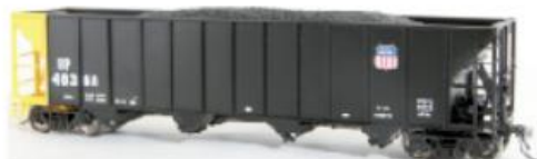
UP "1997 H-100-19 Black Repaint" V2 SKU 10862 (2#s) New Numbers for 2019