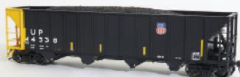
UP "H-100-18 Black Repaint Conspicuity 2005+" SKU 10870 (1#)