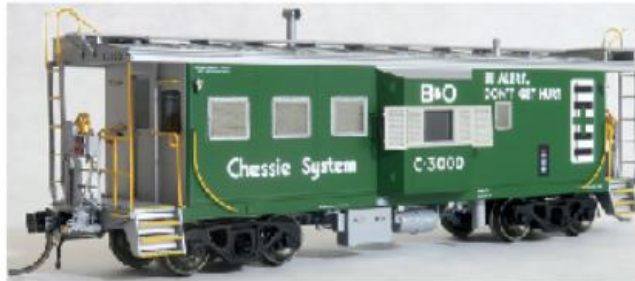
B&O "Green Chessie Safety 1973+" SKU 60013 (1#)