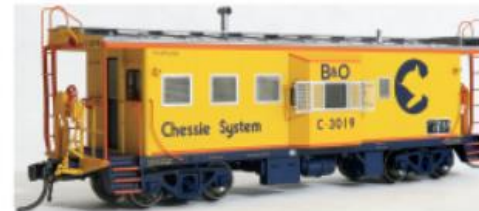
B&O "Chessie Raceland Repaint 1980+" SKU 60017 (1#)