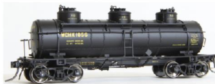
WCHX "Black Lease 1961+" SKU 11521 (2#s)