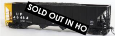
UP "1997 H-100-19 Black Repaint" V3 SKU 10866 (1#)