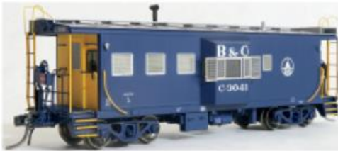
B&O "Original Blue 1968+" SKU 60010 (4#s)

These replicas include lighting options specific to each roadname and are packed with detail, inside and out. $89.95 ea.