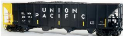
HLMX "Ex-UP H-100-17" SKU 10873 (2#s) New Scheme for 2019