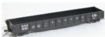
Reading GHH "Original 1941" SKU 10916 (6#s)

First produced by Bethlehem Steel in March 1937, this design resulted in over 9,000 cars produced by 1957 for a half dozen roads. These drop-end gondolas served every corner of North America in many services. $38.95 ea.