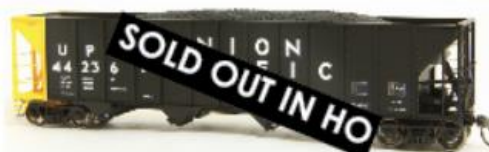
Union Pacific "Original H-100-17" SKU 10813 (12#s)