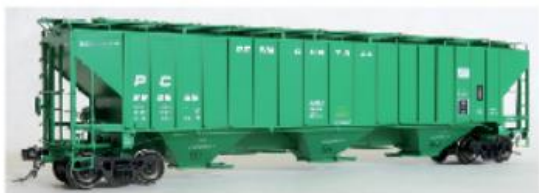
Penn Central "Original 1974" SKU 20033 (6#s)