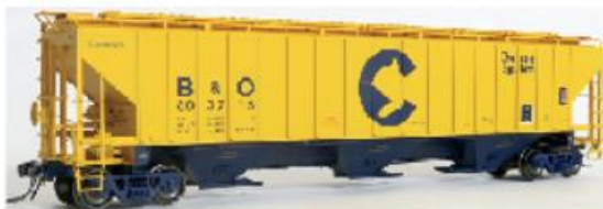
B&O Chessie System "Original 7-1973" SKU 20027 (12#s)

The most prolific covered hopper ever produced. Our PS4750 is tooled for more than 50 phase variations, including outlet gates, roofwalk designs, and brake systems, to name a few. They are simply unmatched in fidelity, quality, and execution. No "one size fits all" model here. $48.95 each