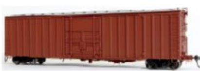
RTR Painted PRR Freight Car Red w/HC UF SKU 14005-01