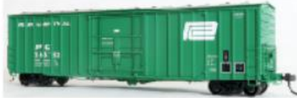
Penn Central "1974 X58B Repaint" SKU 14021 (3#s)