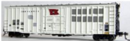
Conrail "LV 1979 X58 Restencil" SKU 14019 (1#)