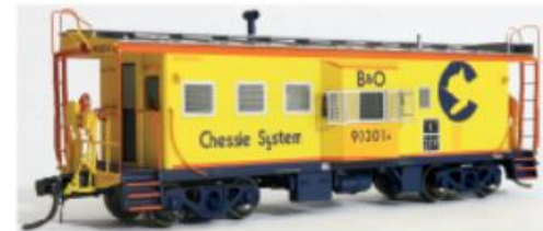
B&O "Chessie System 1982+" SKU 60019 (2#s)

TANGENT SCALE MODELS In-stock now for ordering!