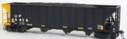
UP "H-100-19 Black Repaint Conspicuity 2005+" - SKU 10872 (1#)