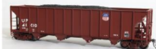
UP "1982 H-100-19 Red Repaint" SKU 10865 (1#)