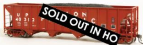
Union Pacific "Original H-100-16" SKU 10811 (12#s)