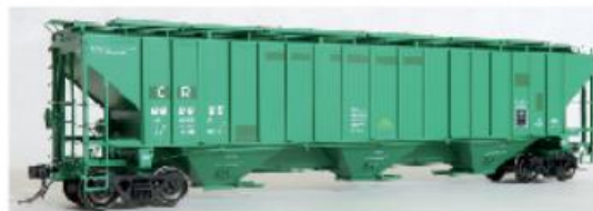
Conrail "Ex-PC Patch" 1978+ SKU 20034 (1#)