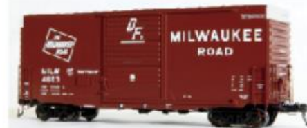
Milwaukee "Original 1968 DFB" SKU 18017 (3#s)