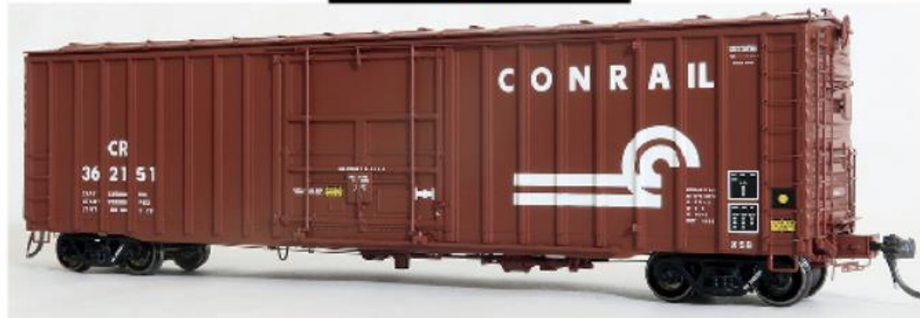
Conrail 1978 X58 Repaint SKU 14024 (3#s)