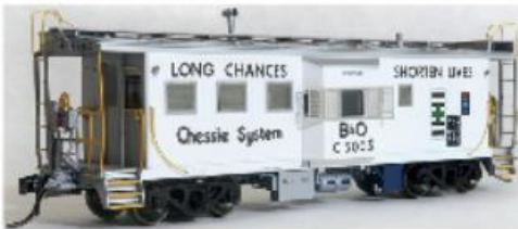
B&O "White Chessie Safety 1975+" SKU 60015 (1#)