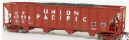
Union Pacific "Original H-100-19" SKU 10815 (12#s) New Numbers for 2019