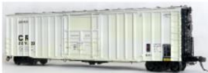
Conrail "LV 1976 X58 Restencil" SKU 14023 (1#)

X58 Boxcar Undec KIT CR Version ($38.95) SKU 14002-03