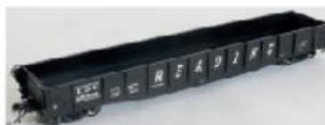
Reading "GHH Repaint 1956" SKU 10923 (6#s)