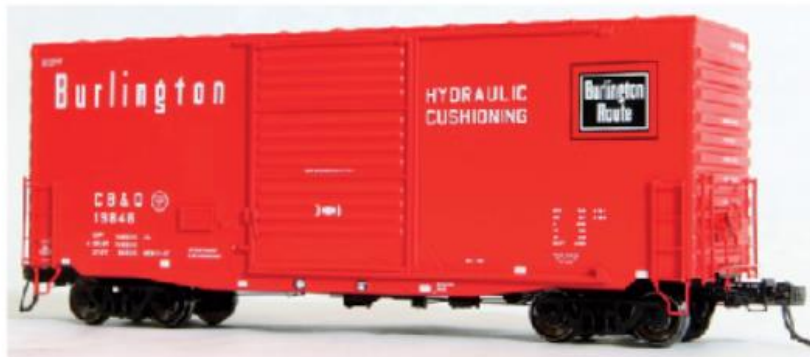
CB&Q "Chinese Red 11-67" SKU 18015 (4#s)

A speciality boxcar from the 1960s, which we have accurately offered with appropriate phase details such as draft gear. These pooled appliance cars could show up anywhere! $44.95 each.