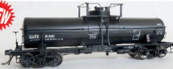
GATX Black Lease 1974+ SKU 22120 (4#s)