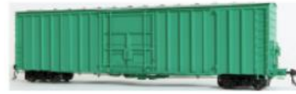
RTR Painted PC FGreen w/Keystone UF SKU 14006-01