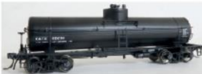
GATX Black Lease 1948+ SKU 22010 (4#s)