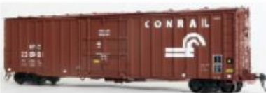
NYC "1999 Restencil" SKU 14025 (1#)