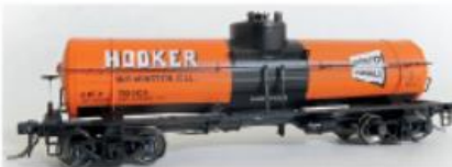
GATX Diamond Chemicals 1959+ SKU 22011 (4#s)