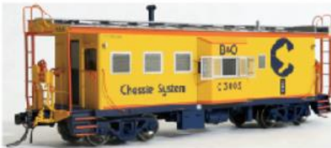
B&O "Chessie System 1973+" SKU 60012 (4#s)