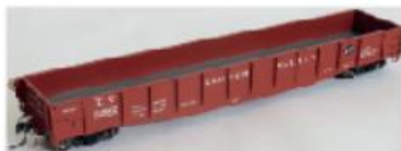
Lehigh Valley "Original 1942" SKU 10921 (4#s)