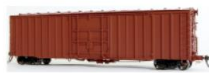
RTR Painted CR Red w/Keystone UF SKU 14007-01