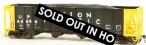
Union Pacific "Orig. H-100-18" Double Rotary SKU 10840 (2#s)