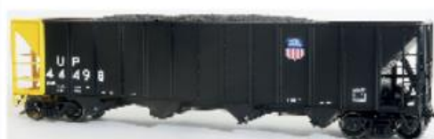
UP "1989 H-100-19 Black Repaint Double Rotary" SKU 10868 (1#) New Scheme for 2019