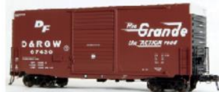
DRGW "Original Brown 1967 DF" SKU 18016 (3#s)