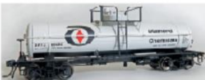
GATX Diamond Chemicals 1959+ SKU 22060 (4#s)