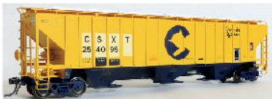
CSX "Ex-Chessie Patch" 1988+ SKU 20028 (2#s)