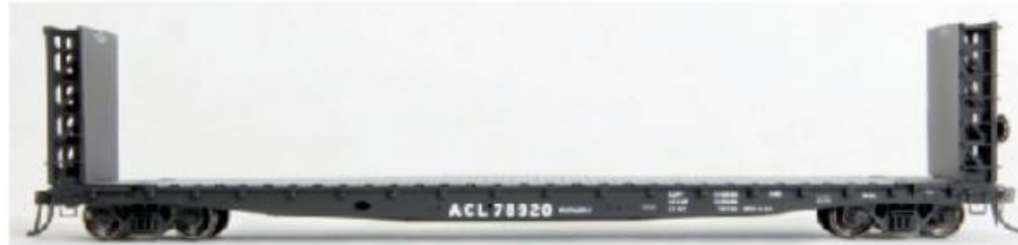
ACL "Original Black 1964+" SKU 11050 (2#s)

TANGENT SCALE MODELS In-stock now for ordering!