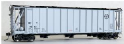
MP "Original Gray" 1959+ SKU 12022 (2#s)