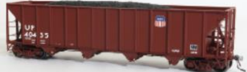
UP "1986 H-100-16 Red Repaint" SKU 10863 (1#)