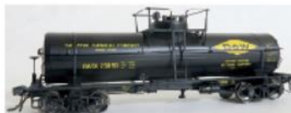
GATX DOW Pittsburg CA 1964+ SKU 22061 (4#s)