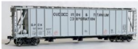
GACX "Quebec Iron & Titanium" 1959+ SKU 12025 (2#s)

TANGENT SCALE MODELS In-stock now for ordering!