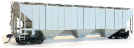
Undecorated RTR SKU 11208-01