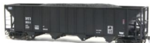
DT&I Original Black SKU 10856 (6#s) New Numbers for 2019